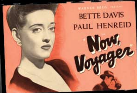
KODAK SAFETY FILM