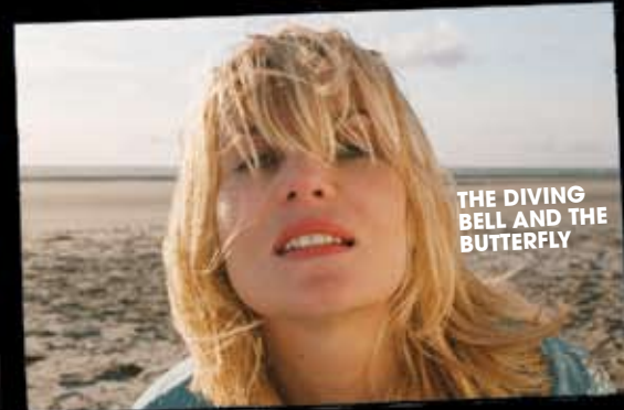
THE DIVING BELL AND THE BUTTERFLY