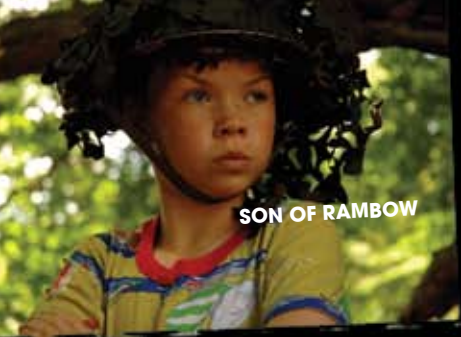
SON OF RAMBOW