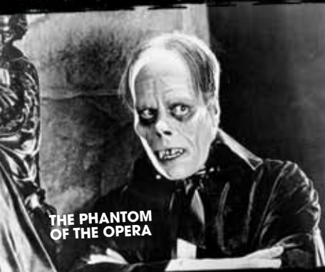
THE PHANTOM OF THE OPERA