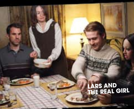
LARS AND THE REAL GIRL